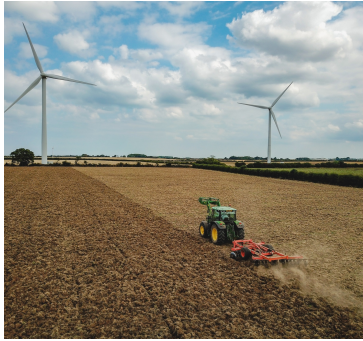
USDA OCIO CPIC, Enterprise Architecture, Technology Business Mgmt, IT Governance