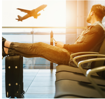
DHS/TSA Innovation Task Force BAA - XRT4 Demonstration