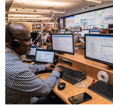
HHS/FDA - Global Tier 1 and Tier 2