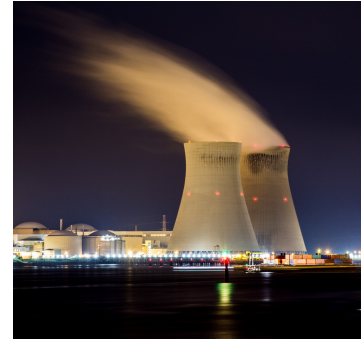
U.S. NRC - Safeguards LAN and ESAFE