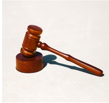
U.S. Tax Court - IT Modernization, O&M