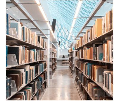
Smithsonian - IT Audit