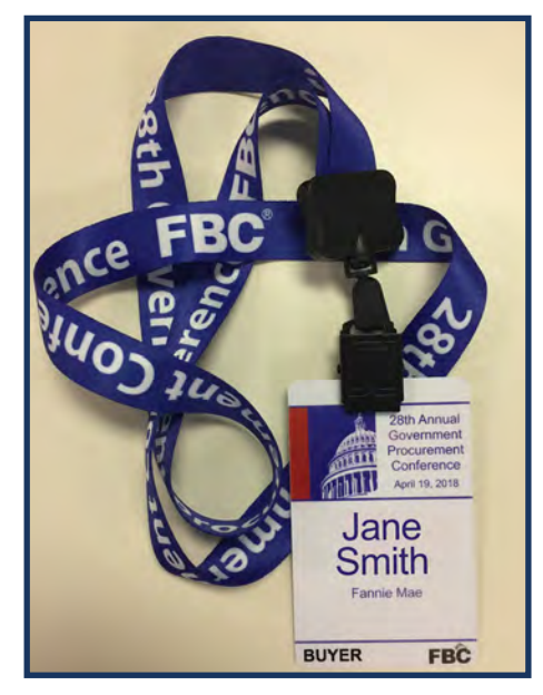
FBC does secure on-site registration, including badge printing.

FBC creates and prints high-quality, full-color posters for your event. We also provide custom directional signage.