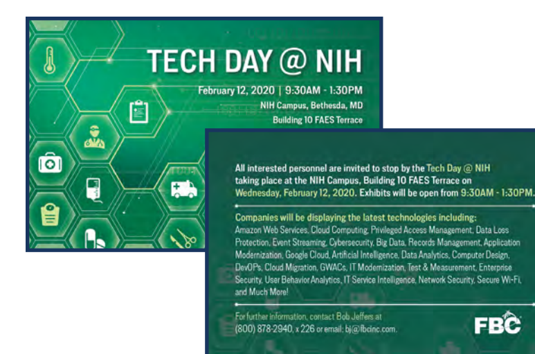
FBC builds compelling graphics that give your attendees all the pertinent details.